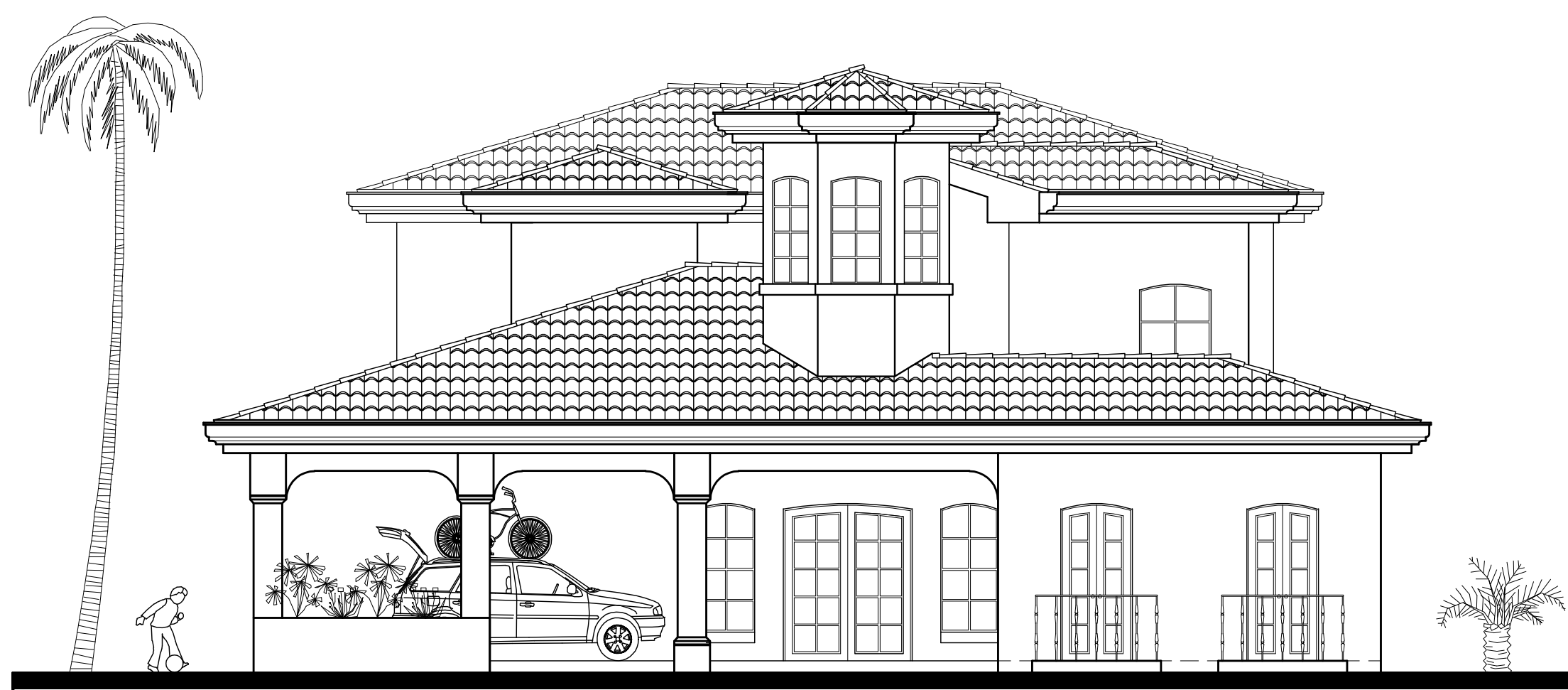
GUANACASTE PRINCIPAL ELEVATION SCALE: 1:75